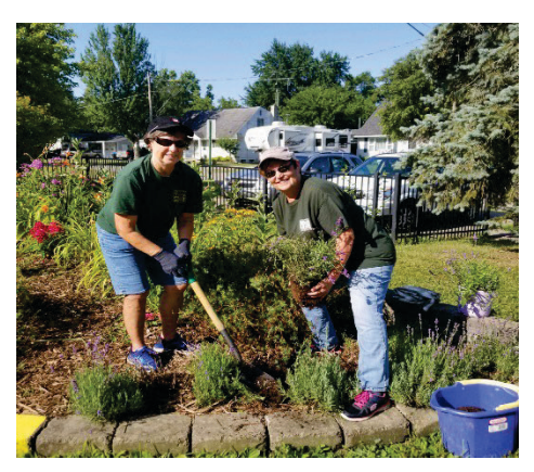
Genesee County Master Gardeners working in Rust Park located in Grand Blanc

In 2024, Genesee County residents from this region participated in MSU Extension Consumer Horticulture programs such as fruit tree grafting, indoor plant propagation, plant selection for native pollinators, winter garden planning and tree pruning. This included virtual programs such as Dig In!, a continuing education program for Extension Master Gardener Volunteers that prepares them to work with and educate the public. Residents also participated in the ten-week Foundations of Gardening course. Eleven scholarships were awarded to Foundations of Gardening participants in this region.