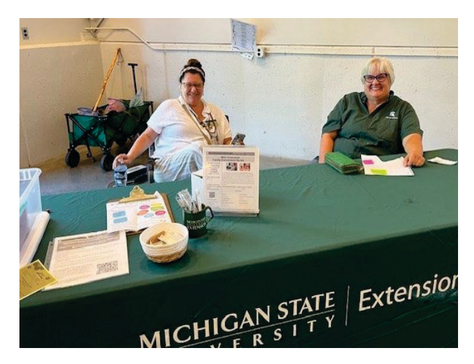
Child and Family Development staff at Flint Farmer's Market for Project Fresh