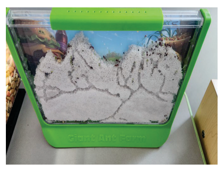
Giant Ant Farm

4-H provided numerous in-school and after-school programs in Genesee County, focused on garden-totable education and healthy eating. These initiatives helped youth understand the importance of nutrition, sustainability and food systems, empowering them with the knowledge to make healthier choices and appreciate where their food comes from.