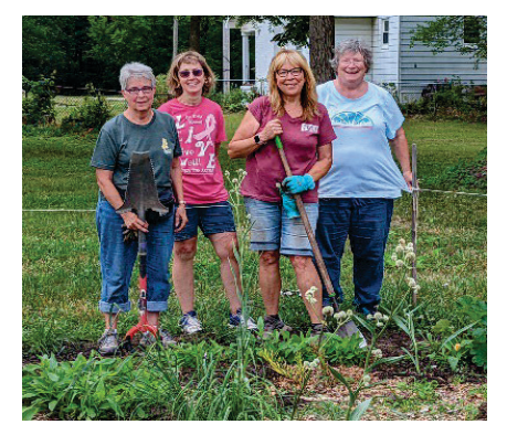
Genesee County Master Gardeners working in the Pollinator Garden at Edible Flint Education Farm located in Flint.

The Consumer Horticulture team works with local organizations such as Edible Flint, DeVries Nature Conservancy, libraries, and local schools to improve access to horticultural education in the community. The Consumer Horticulture team trains and supervises Extension Master Gardener Volunteers. These passionate volunteers work with community partners across the state, focusing on public education and helping maintain educational gardens such as the Edible Flint Education Farm, Rust Park, Crossroads Village, Dow Gardens, Phoenix Community Farm and the Hemmeter Elementary Arts & Science Garden. They also work with organizations that provide fresh vegetables to those in need through food donation gardens.